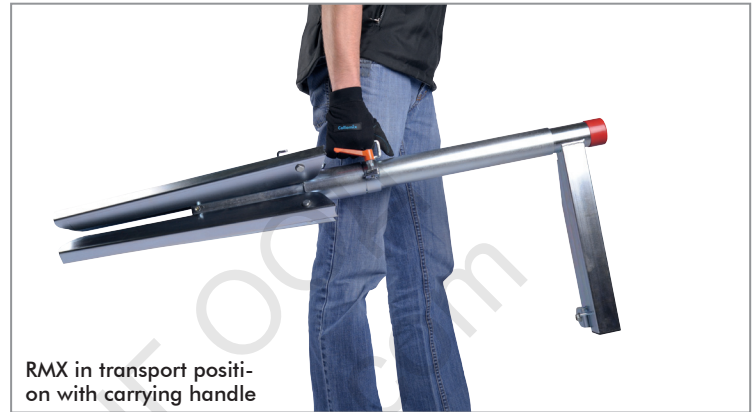
RMX in transport position with carrying handle